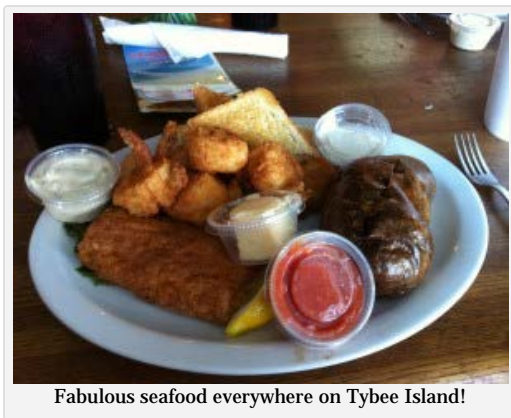
Fabulous seafood everywhere on Tybee Island!

If you liked boiled seafood with a spicy Cajun kick, I can highly recommend “The Crab Shack”, a rustic seafood restaurant with a huge, wooden deck perched by one of the lagoons with a nice breeze off the water, helped by the many overhead fans. Kids will love feeding the resident (small) captive alligators with special alligator food you can buy from your waiter or waitress. If you like your seafood fried, try the “North Beach Grill”, which has great live music nightly (the steel drums were especially enjoyed by our group) – or “AJ’s Dockside Restaurant”.