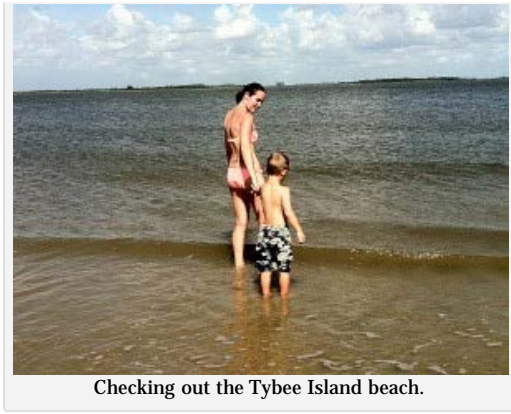
Checking out the Tybee Island beach.

located on the North side of the island. I recommend this side of Tybee Island for families with children. The South side is much busier with a pier, shops and restaurants and the water is also much rougher. However, the South side is definitely more convenient for activities, so your choice of accommodations just depends on your vacation preferences.