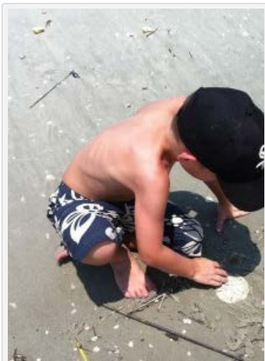
Finding a sand dollar.

Tybee Island has an historic lighthouse with tours, as well as a museum and restored lighthouse keeper’s cottage. It was well worth the very reasonable price of $8.00 – seniors are only $6.00 and kids 5 and under are free. The lighthouse and the surrounding buildings are perfectly restored and it’s fascinating to view a completely different way of life. Prepare yourself for the 178 stairs to the top, though! Take in the beautiful view of Tybee Island from the top as you take a breather. There’s a nice little gift shop where you can pick up some souvenirs and cool off in the air-conditioning after that climb.