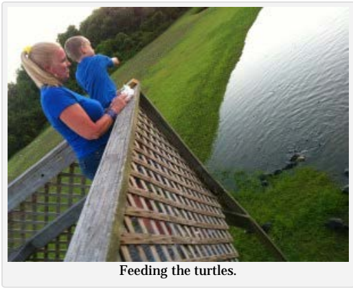
Feeding the turtles.

We couldn't wait to see the beach, so we immediately headed across the wooden sidewalk which became a bridge over a quiet, scenic fresh water lagoon with clear green water. As we neared the lagoon, we were puzzled by all the tiny black shapes poking up out of the water and couldn't imagine what they were. When we got closer, we realized they were the heads of turtles that were lazily floating on the clear, green water – hundreds of them! We found over time that they were pretty laid back, until someone appeared on the bridge with bread: you wouldn't believe how fast those turtles can move!